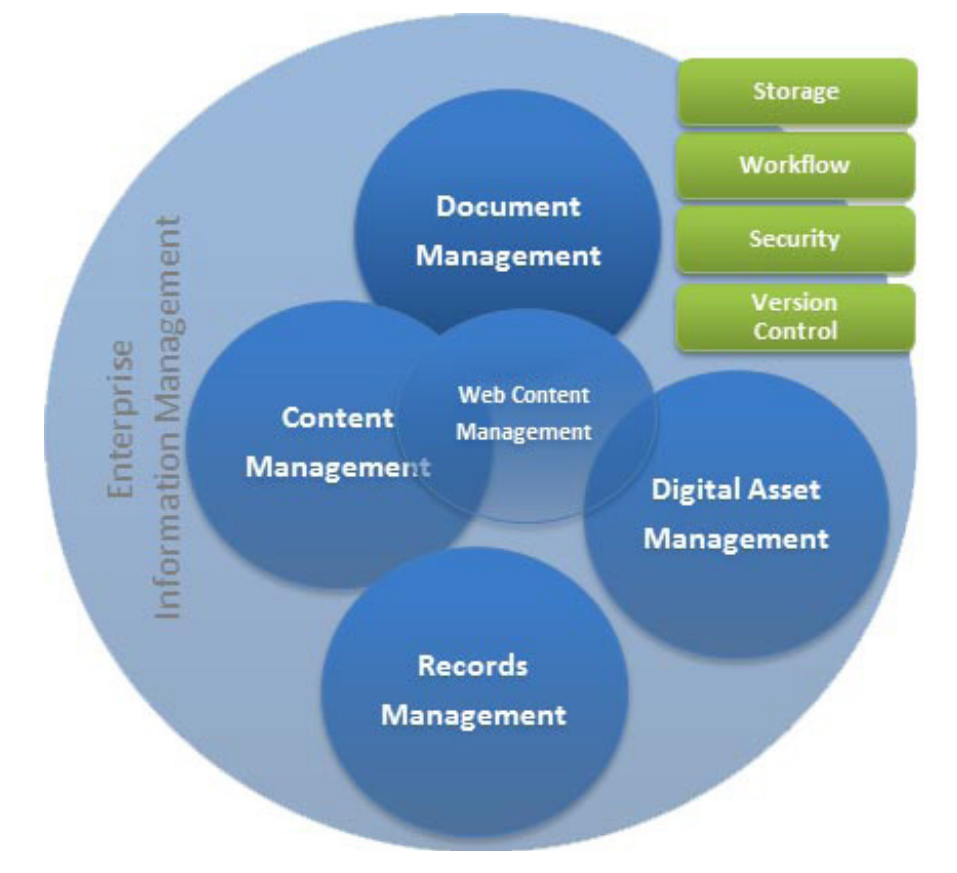
Figure 2 - Managing Organizational Information

Documents are an important business asset, but they are not the only form of information that organizations create and manage. Therefore, it is useful to understand how document management relates to the larger concept of managing enterprise information.