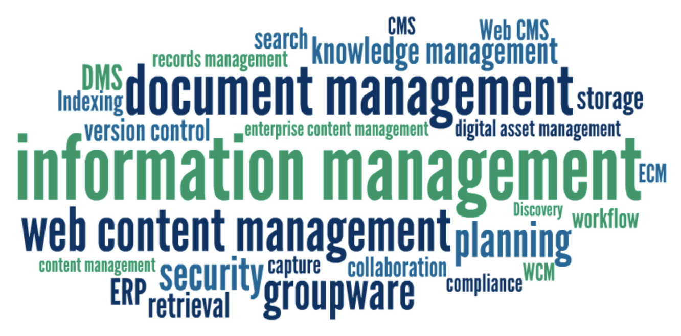
Figure 1 - Document Management Buzzwords

A quick search for "document management system" in any search engine yields tens of millions of results. While it is comforting that a wealth of information exists on the topic, it can quickly become difficult to decipher the tangle of jargon.